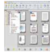
PaperPort SE 14

- The Professional Choice to Organize and Share Your Documents